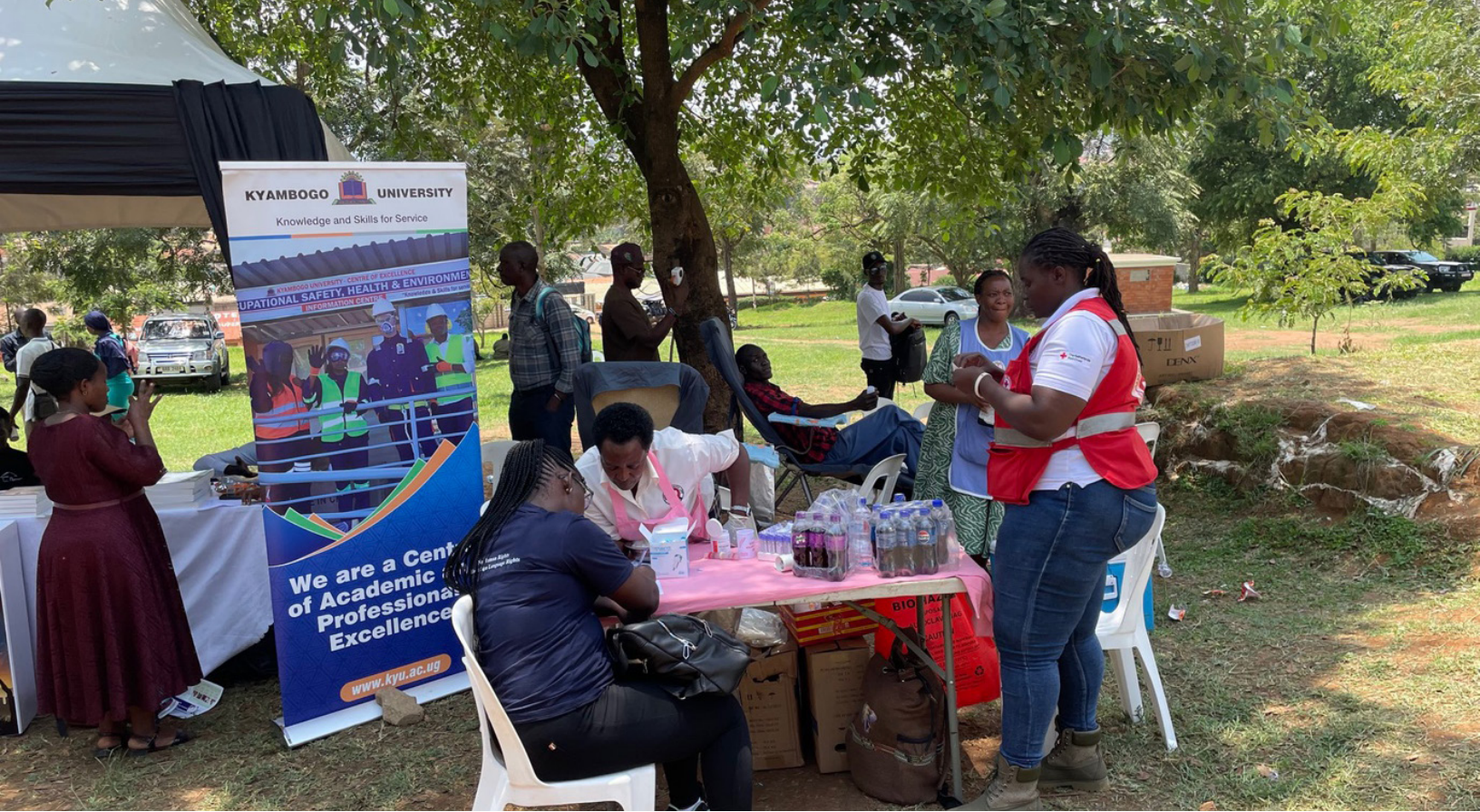
Photo: Blood donation and health check during Deaf week climax.