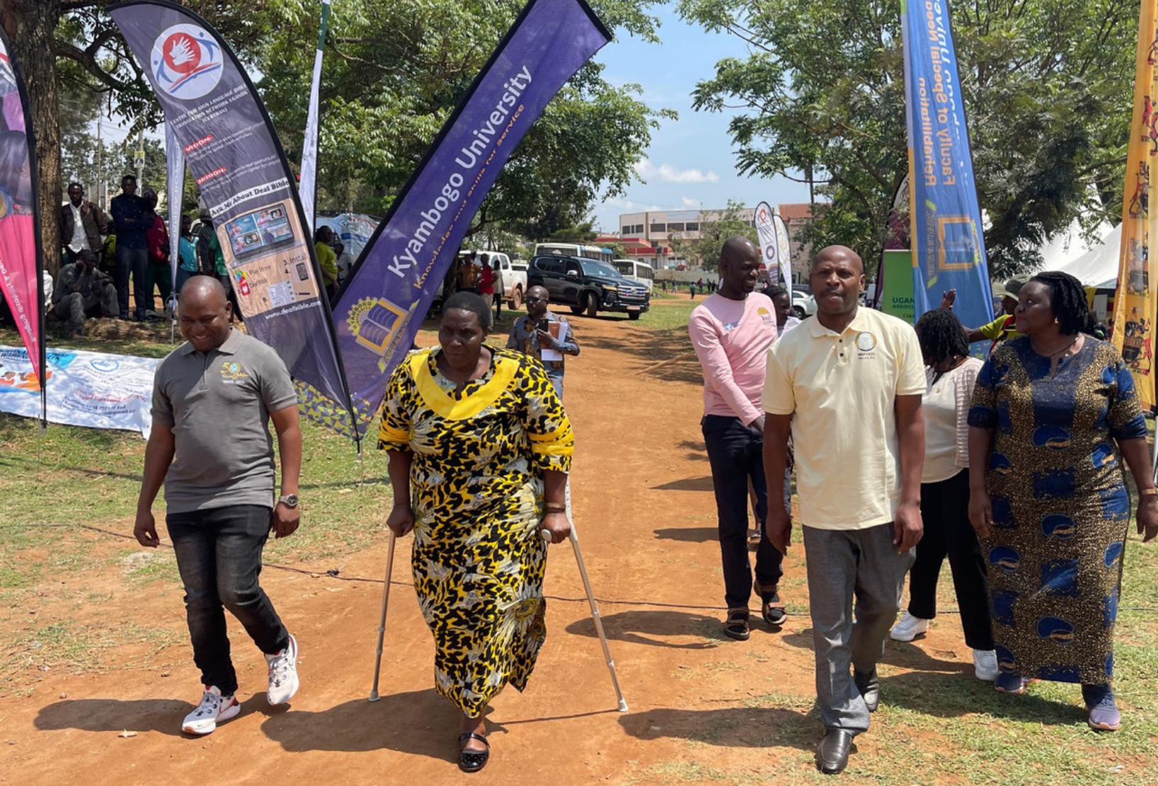
Photo: Hon. Minister Hellen Grace Asamo (Center) arriving at the venue accompanied by the Chairperson parliamentary Forum on Disability (right) and Executive Director UNAD (left)

Based on the Ministers statement, UNAD should (recommendations):