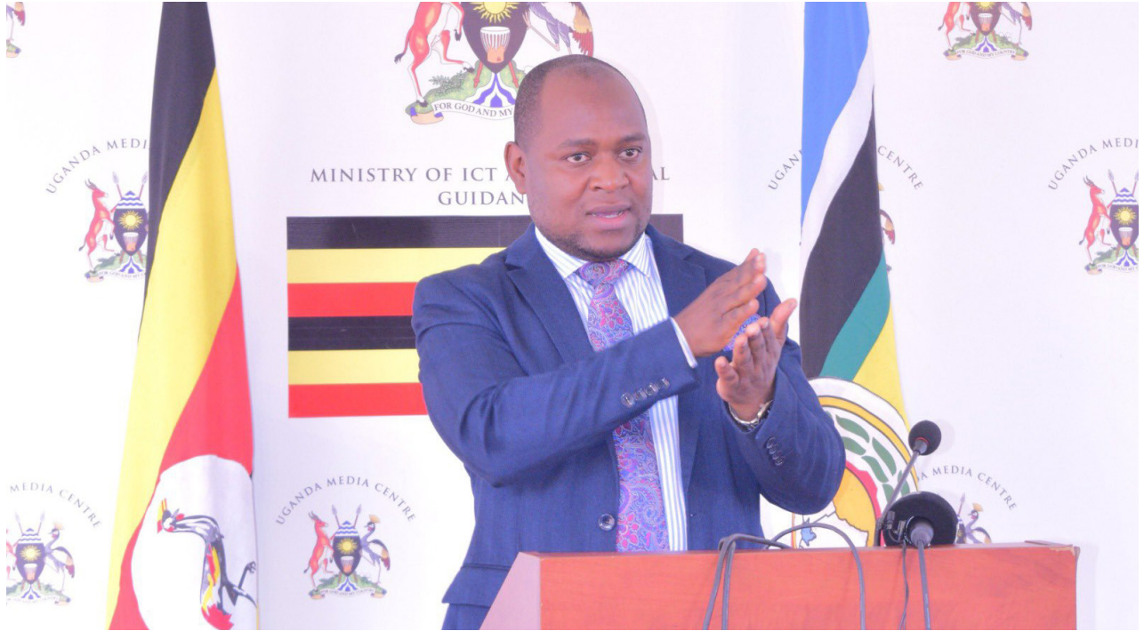
Photo: UNAD Executive Director signs presenting a Statement at National Media Center