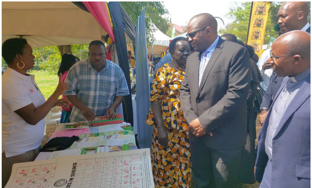
Photo: Chief guest inspecting exhibition stalls at the IWDP.