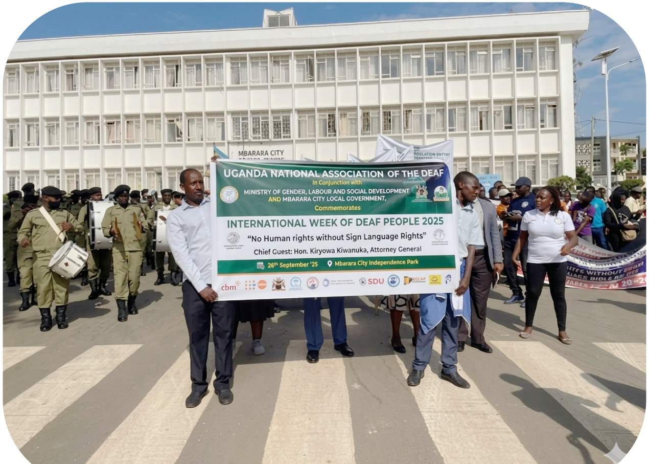
Photo: Participants begin the deaf week march past from Mbarara City Hall, led by the Police Band.