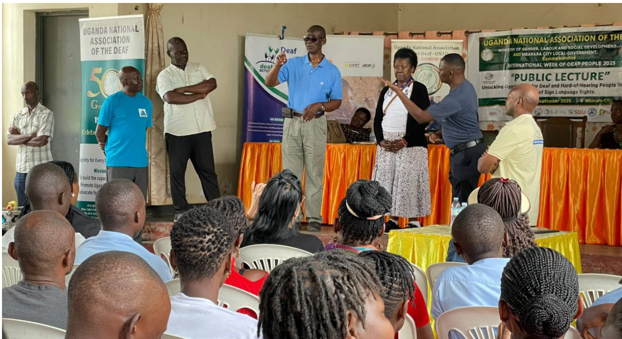
Photo: Attendees during the public lecture

Later in the evening, the movie premiere of “SPEAK” was held. Produced by KPM Entertainment Studio, the film amplifies Deaf voices in Ugandan cinema and tells the story inspired by the resilience of the Deaf community. The film features Deaf actors cast through an inclusive process with Sikia Café Jinja and has achieved six nominations at the Uganda Film Festival and selection at the Kaduna International Film Festival in Nigeria.