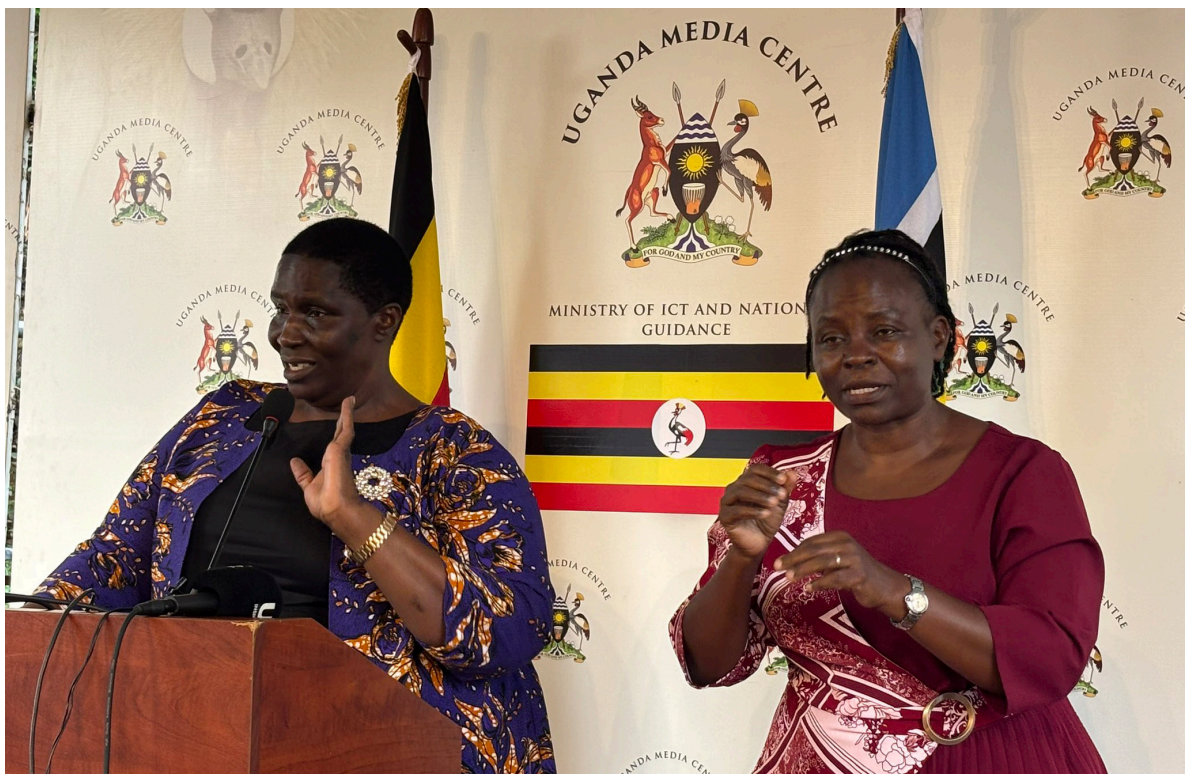
Photos: Honourable Minister of State for Disability presents IWDP statement at National Media Center