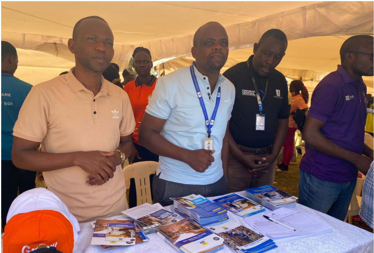
Photo: URA officials exhibit and deliver tax administration sensitization during the IWDP