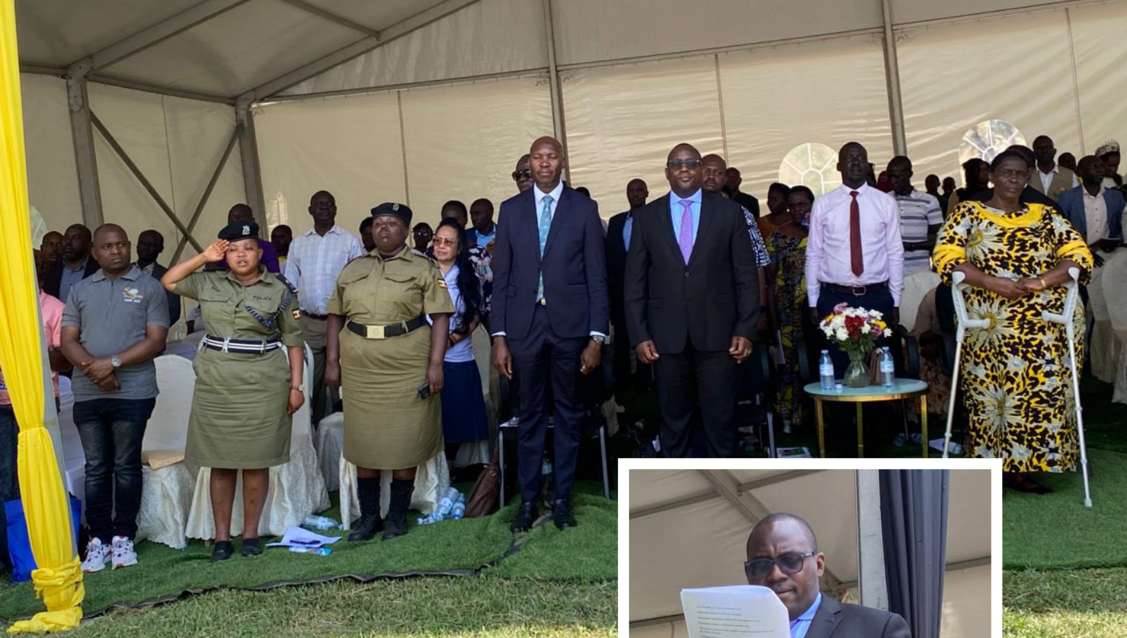
Photo: Government Solicitor General, Ministry of Justice and Constitutional Affairs giving his speech as Chief Guest.