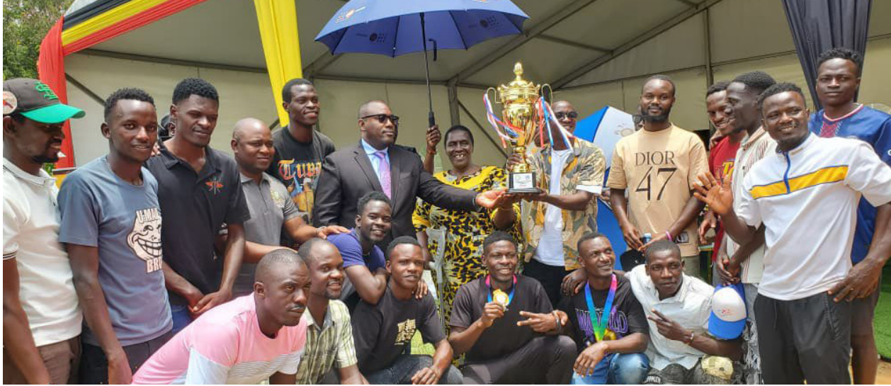
Winners of the 2025 Deaf Week cup being presented their trophy and awards by the Chief Guest.

A football match between Bright Stars Deaf FC, winners of the National Deaf Challenge Cup 2025, and Mbarara University Football Team (comprising hearing students) was held at Mbarara University Sports Grounds. Bright Stars Deaf FC won the match, showcasing the skills and talents of deaf footballers and promoting sports inclusion between deaf and hearing communities.