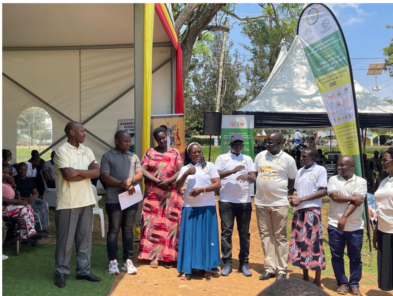
Photo: UNAD's Board of Directors at the IWDP 2025.

in education and services. He asked stakeholders to support sign language training for service providers, promote deaf inclusion, and advocate for equal access to opportunities for deaf individuals. He reiterated that UNAD will continue advocating for sign language rights, promoting UgSL, and addressing barriers in education, healthcare, and social inclusion for deaf individuals.