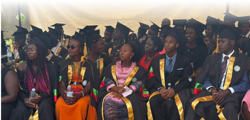
Photo: Some of the UNAD Vocational graduands at the ceremony.

The event was attended by about 250 people, including community members, parents, and stakeholders. The graduation marked a significant milestone for the trainees, equipping them with practical skills to enhance their economic opportunities and contribute to their communities.