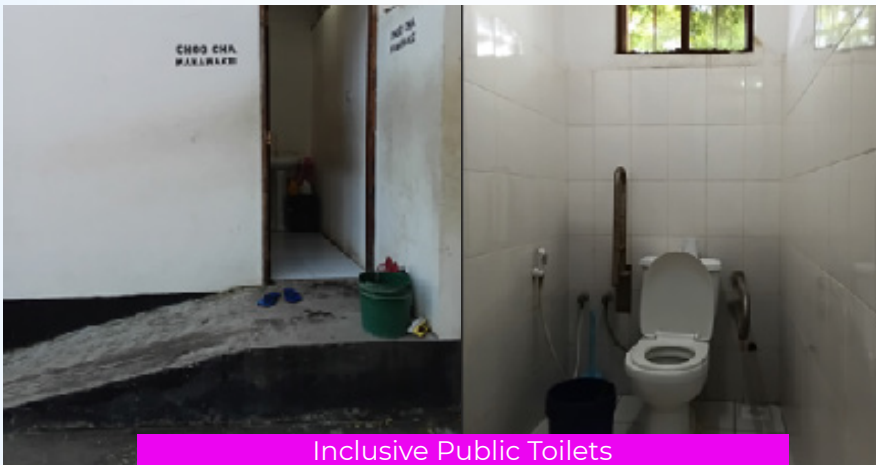
Inclusive Public Toilets

Thanks to consistent CBID advocacy, the government's major road construction project in Unguja's Urban region now includes disability-friendly features. Pedestrian pathways have been integrated into roads like the Airport-Mnazi Mmoja route, ensuring safer and more inclusive mobility. The commitment extended as far as demolishing a section of the Presidential residence wall to make way for accessible pathways—a powerful symbol of inclusive development in action.