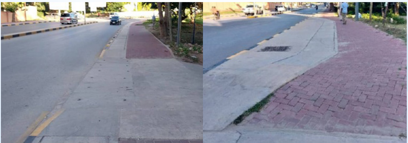
Pictures of Airport – Mnazi Mmoja road, designed with pedestrian walkways where people with disabilities use conveniently.