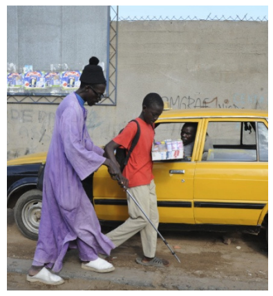
ACCESSIBILITY AND TRANSPORT