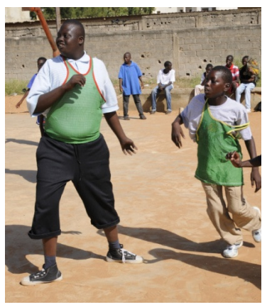
SPORTS & RECREATION