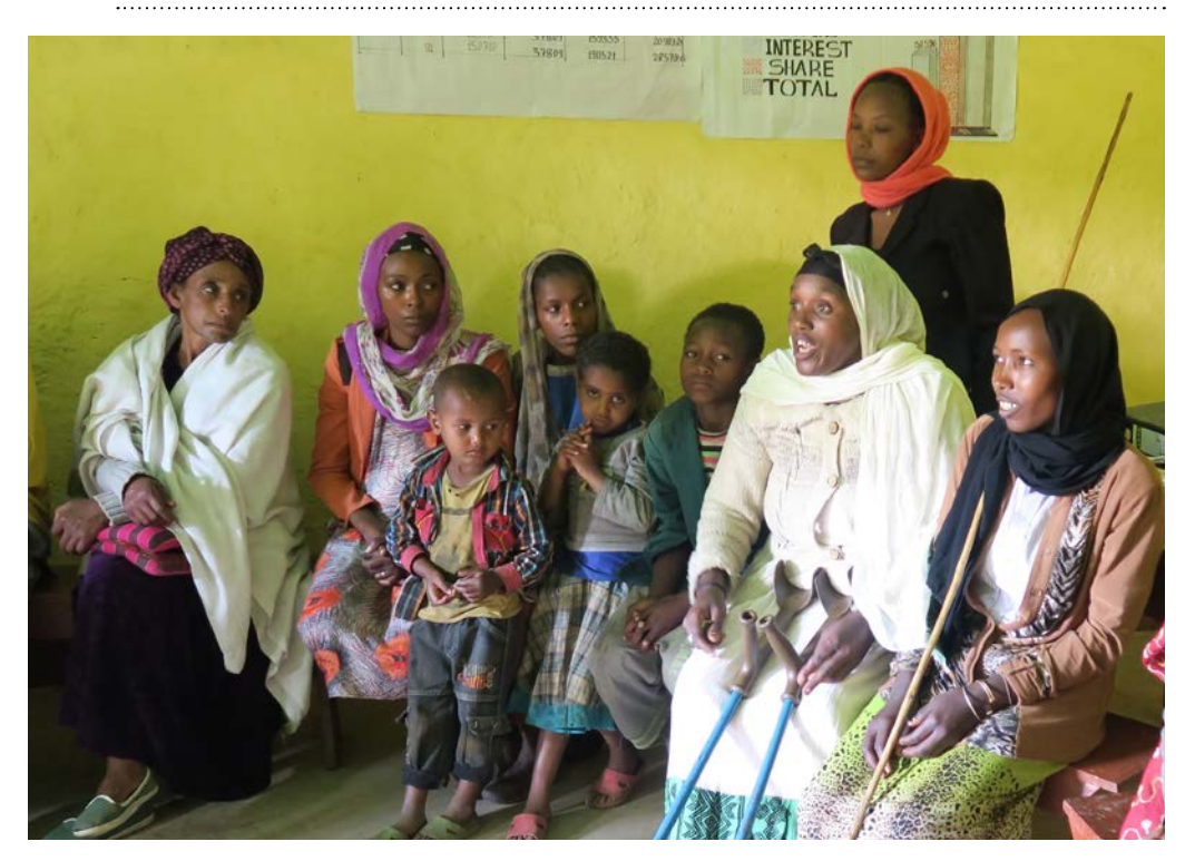
Women with disabilities at a DPO meeting.

Light for the World supports initiatives of local partner organisations (NGOs and government partners) to safeguard local ownership and cultural as well as structural sustainability. Light for the World is represented in Ethiopia through a Country Office which is the first point of contact for partners and other stakeholders. The Country Office acts as a link between the operational partners and Light for the World, providing support and advice, strengthening capacities of the partners and getting engaged in networking and dialogue. Recently the Country Office has also taken on a partial implementation role in the NTD and IE programmes, where Light for the World staff are also seconded to partners.