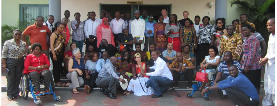
Caption: Group picture of Bridge CRPD-SDGs East & West Africa, Module 1, Ghana, Nov 2016