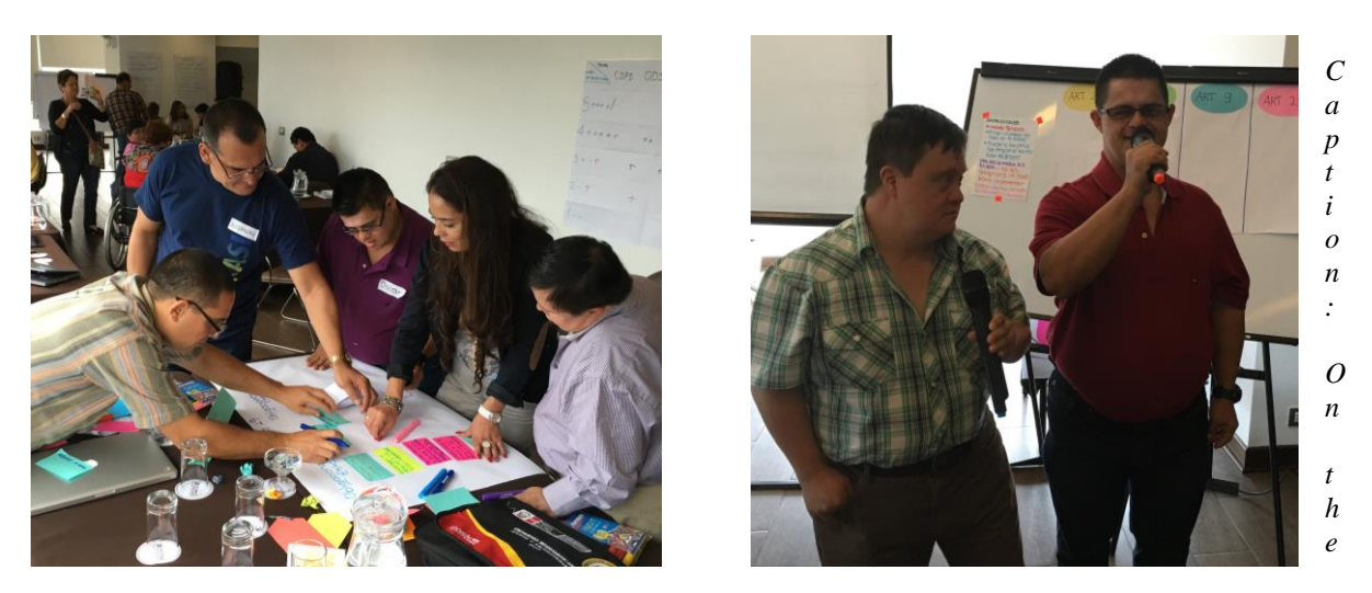
left, a group creating a presentation. On the right, two participants presenting a session on self-advocacy and their rights. Both moments were during Bridge CRPD-SDGs Latin America.