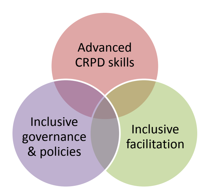
Fig. B – Core skills for Bridge CRPD-SDGs trainers and co-facilitators

Caption: The above slide represents 3 intersecting circles of CRPD, governance and policy, and inclusive facilitation.