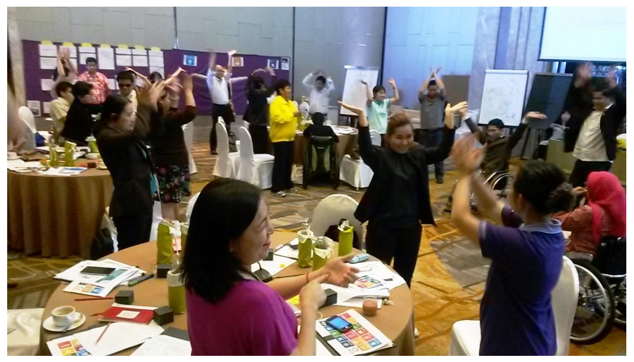
Caption: Picture of Bridge CRPD-SDGs South East Asia participants during Module 2, doing an energiser proposed by one of the participants.