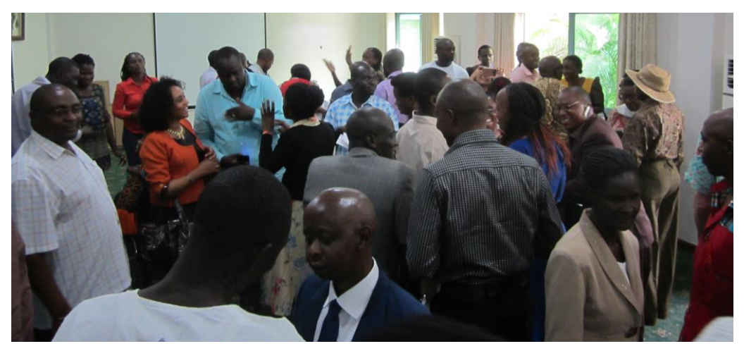
Caption: Picture of the Bridge CRPD-SDGs East West Africa – Participants during Module 1, doing a 'Speed dating' activity.

This document therefore presents the Bridge CRPD-SDGs Training Initiative as a work in progress, about four years after its start.