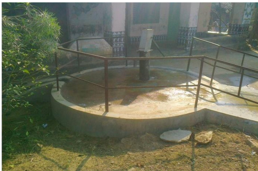
Tube well platform with RAMP (At Jhillimunda Primary School, Balikhamar G.P., Tarva Block)

The district administration has also provided funds for building PWD friendly hand pumps in many Gram Panchayats. 14 such hand pumps have already been installed. Efforts are being made to build at least one such structure in all Gram Panchayat.