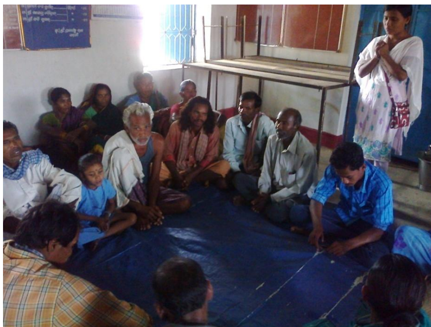
Training of SHG members on group activates at Baghia