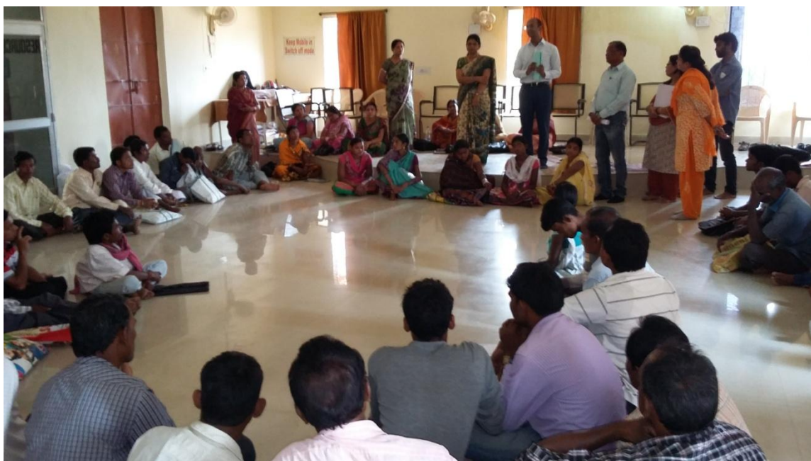
Block Level Federation meeting of Tarbha BLF