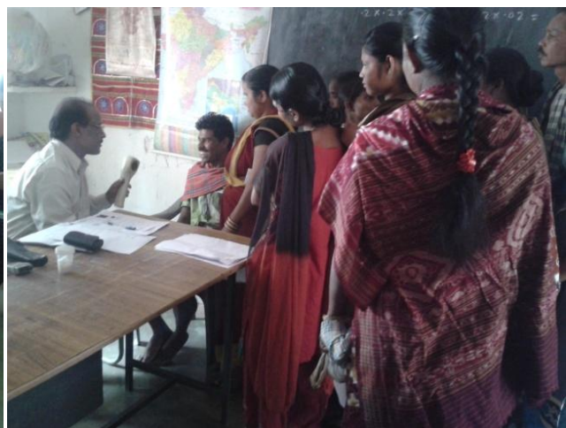
Medical-cum-Vocational Assessment Camp