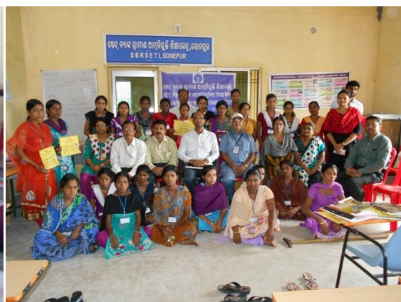
Training programmes and certificate distribution