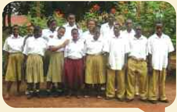
Participants from Bigwa FDC