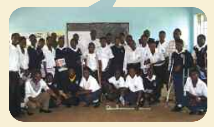
Participants from Rock High School