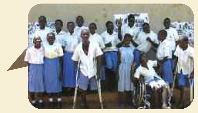
Participants from Agururu Primary School