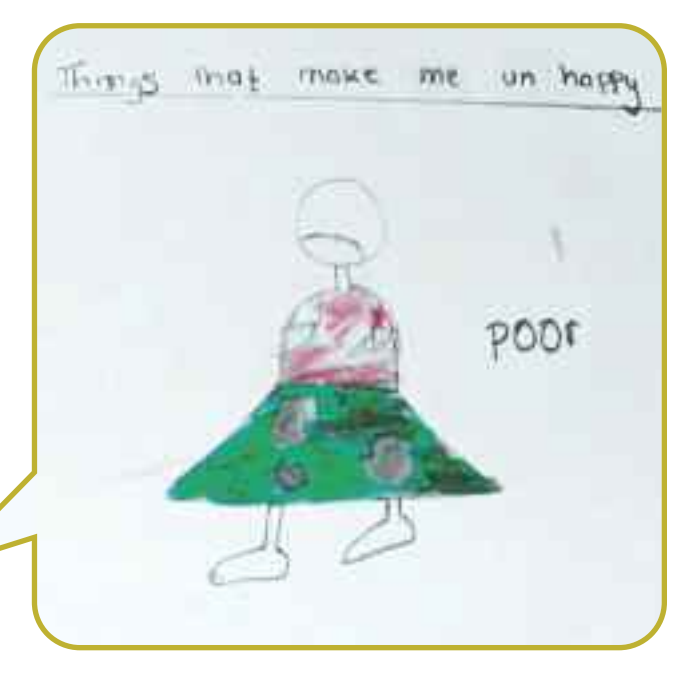
Drawing by Blantina Nyachwo

Blantina Nyachwo, deaf student, Agururu Primary School